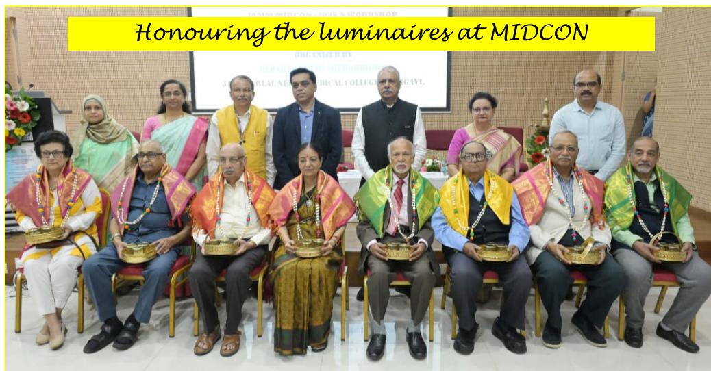
Honouring the luminaires at MIDCON

Each course is open for 15-20 students. The flyer will be updated on our website and registration form will be soon available with payment details. Registration entails refreshment and stationary for delegates and faculty. Candidates will have to bear the cost of travel and stay. Organizers will bear the cost of infrastructure and laboratory consumables required.